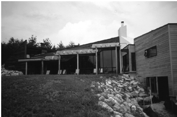
View of Burrows Residence showing south facing exposure

There were limitations to the accuracy of the investigation. Since this building does not have full time occupants, occupant surveys could not be performed. Also, due to the nature of the camp program the building was in use by different occupants on a daily basis. This factor made it impossible to shut down the wood firings in order to selectively test the building's passive qualities.