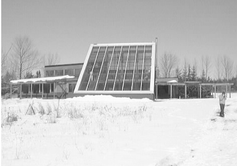
South elevation of solarium building

The first site visit revealed that there were no plants in the greenhouse. This would effect the interior temperatures of the space, and was kept in consideration when regarding the data as the plants would normally absorb much of the solar energy. The floor of the greenhouse was simple 3/4 inch plywood. Upon discussion with the architect it was revealed that the intent was to fill the space under the floor with water that would cool the space in the summer and retain heat for the winter, acting as a sort of trombe wall. The water would act not only as the water supply for the plants, but also contain a full ecosystem, with underwater plant life and fish. It was also indicated that water gathered from the sloped roofs is also run down the window, cooling it in the day.