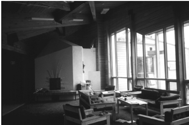
Interior view of common room and masonry heater

It would appear from the collected data that the heater was not fired in the evening of March 10 and in the evening and morning of March 11. However, during this time the temperature of the main room stayed relatively steady. This steady temperature is likely due to a combination of large solar gain during these days and the effectiveness of the thermal mass of the heater. As well, during March 14 and 15 the temperature at the surface of the furnace dropped even though it was still being fired. With a few hours lag-time, this time of lower heater temperatures also correlated with the period of low solar gain. This would suggest that the masonry may also be acting as an effective thermal mass which is strongly effected by the amount of solar radiation. According to employees at the Environmental Center if the wood furnace isn't fired at all, it takes several days for the building to get down to 3C to 4C where it