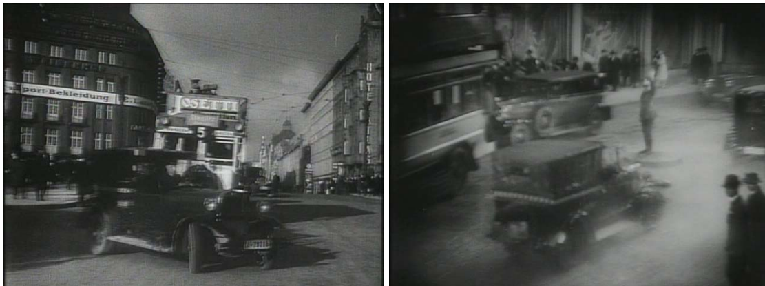
Fig 3: Establishing shot (left) and set (right) for Asphalt .

Narrative films tended to use a combination of live establishing shots and studio sets. Joe May's Asphalt (1928) gave the appearance of being set in Berlin due to the inclusion of live footage at its opening. The balance of the film uses staged sets. This begins the formulaic base for the simple collage-like layering of many films of this period where, "The image condenses an idea of the metropolis rather than an actually existing space, conveying mood more than geography." 12