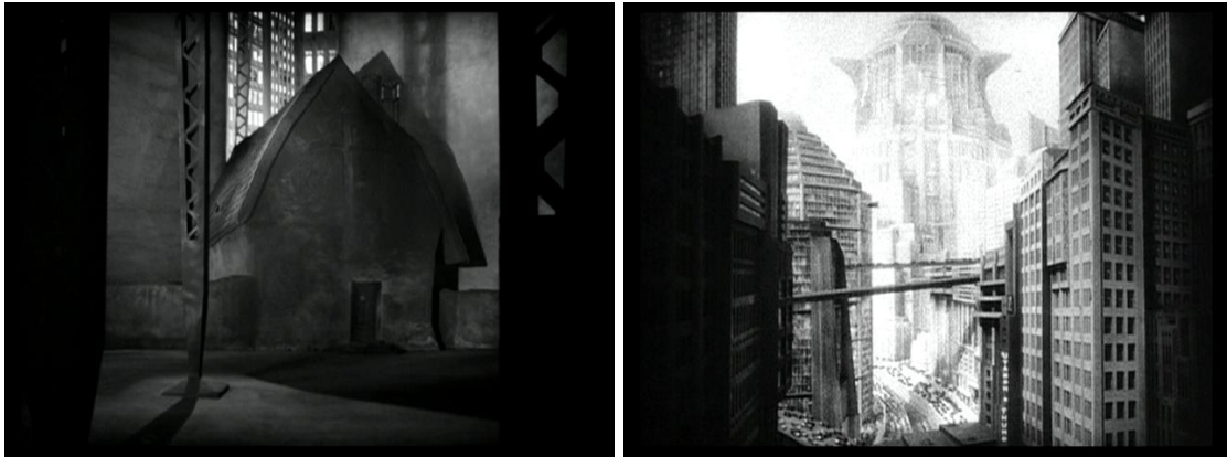
Fig 8: Metropolis – Rotwang's house (left) and the Tower of Babel (right)

between different scenes as a result of changes in urban scale. The use of scale models and animated effects for the dense urban space in which the Tower of Babel is situated illustrates a contrast of materials and methods to create the spatial effects of the film. There is a unique sensibility to the scenes that employ the scale models. The scales in the film are either large enough to include live actors, or miniature so as to be unable to include other than stop motion traffic. The lack of a mid range scale, as is the norm in contemporary film, heightens the contrast that leads to this feeling of collage due to juxtaposition.