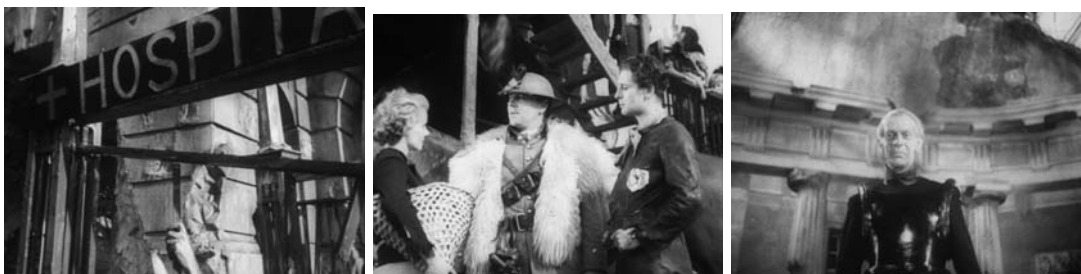
Fig 10: Things to Come – collage in building fragments and clothing

The detailed views of Post War Everytown highlight recognizable elements and signs from the 1936 version. The act of war and subsequent destruction of the buildings has resulted in a harsh rearrangement of the elements that have been in part adapted by the Neo Medieval residents to sustain life. The town resembles an architectural collage of sorts. This rearrangement of found objects can also be seen in the costumes, which reflect an adaptation in keeping with the downturn of civilization and the demise of industrialization. The lack of order that these urban and societal collages represent, enhances the contrast with the civilized order represented in Pre War Everytown . The presentation of the pristine future environment, adds yet another layer of contrast to the montage of images that were are to presume represents the evolved urban idea of Everytown .