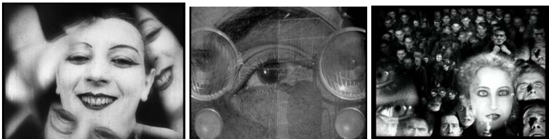
Fig 1: Ballet Mécanique , Emak-Bakia and Metropolis : using similar photomontage collage effects with a focus on "eyes"

Initially, the generation of collage like forms in films was derived from similar work with still images. Photomontages were given extra life with the addition of movement and layering when adapted for film. These collage methods directly relate to the artistic forms of early Avant-garde films such as Ballet Mécanique by Fernand Léger (1924) or Emak-Bakia (1926) by Man Ray. These films were not intending to create a place to accommodate action as much as to explore various aspects of technique and form as disparate elements were combined, juxtaposed and overlaid. These films used collage within each frame via an adaptation of photomontage, odd use of camera angles/focus or simply by the arrangement of the objects being filmed. They also used collage in the arrangement of the sequences, which typically jumped from one to the next without benefit of a transition (i.e. fade or dissolve), with the intention of inducing unease and anxiety in the viewer. Many artists were simultaneously creating in the areas of film and fine art, so many of the techniques and applications provided for the cross fertilization of ideas and innovations.