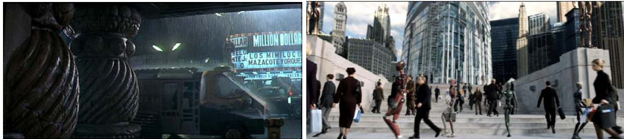
Fig 11: Blade Runner and I Robot – mixing old and new icons

their collage like repositioning in the set. Where an actual disaster would naturally reposition the architectural fragments, film set designers reposition them artistically to create an effect, thereby ascribing collage properties to the compositions. These objects are designed to be found and rearranged, quite unlike the driftwood on the shore. The arrangement of the parts is purposefully designed and fabricated. It is not the result of accident.