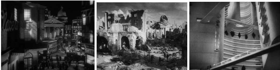
Fig 9: Things to Come – pre and post war setting versus 2036

The act of war is represented within the film by a series of scenes that make primary use of overlay, montage and collage. These editing methods also emphasize the passage of time and explain the degradation of Everytown that transpires as a result.