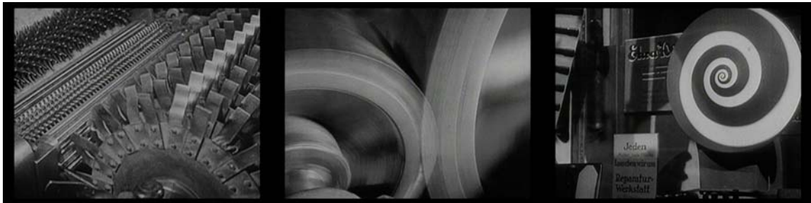
Fig 4: Berlin Symphony of a Great City – focus on machines and machine action

"Coming from a background of abstract graphic design and painting, and having earlier made pioneering abstract experimental shorts, Ruttmann created and manipulated factual material to express the 'feel' of his city through refined abstract patterns and design methods. ... Ruttmann's fascination with endless motion and mechanics transforms the city into a machine devoid of human content." 16