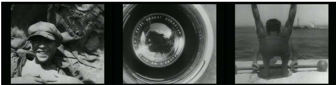
Fig 5: Man with a Movie Camera – focus on people and the act of filming

Where Ruttmann's more abstract editing of the vignettes against criteria of music and time of day tended to de-emphasize the importance, rank or personality of the people within his collage, Vertov's film is about "Life caught unaware" 17 . The focus of the film is the people.