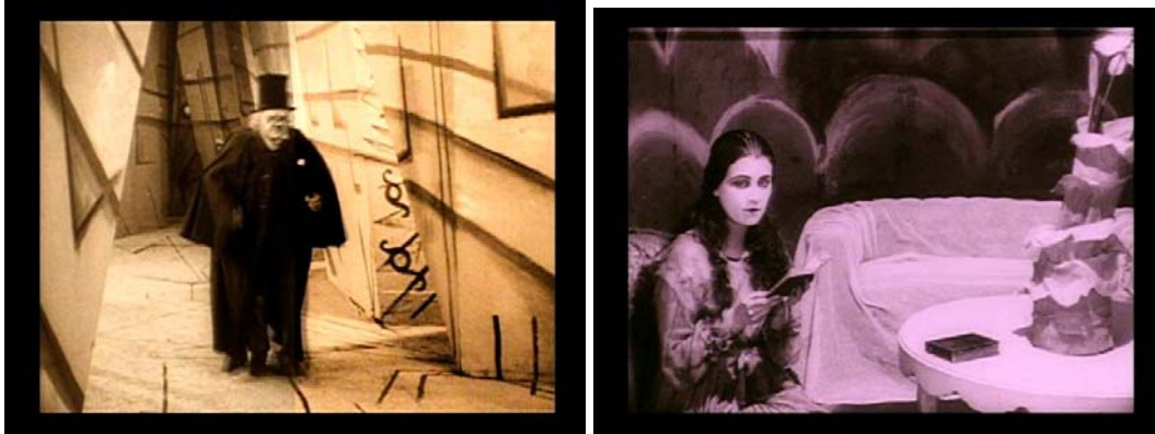
Fig 2: The Cabinet of Dr. Caligari (1920)

German cinema of the post WWI period preferred the use of the studio for its film-making. This fed into interpretations of the urban and architectural environment that were simultaneously independent of the constraints of reality while being limited by technology and finance. The studio environment also allowed for purposeful manipulation of light, which added another artistic layer to the setting. Film environments were dependent on architects for their definition. "The architect's façades and rooms were not merely backgrounds, but hieroglyphs. They expressed the structure of the soul in terms of space." 11