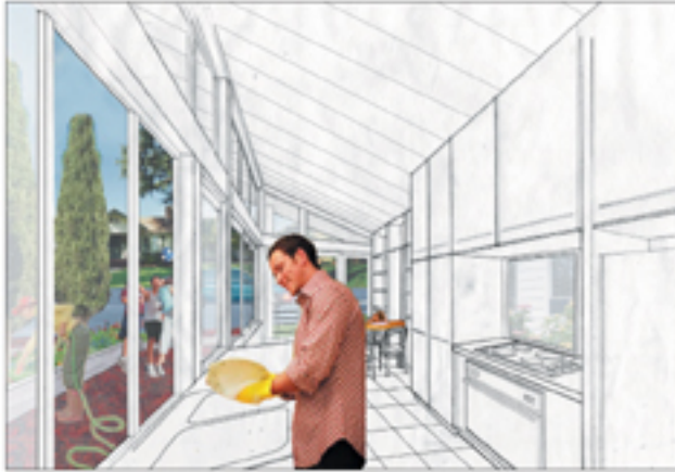
PUBLIC FAMILY SPACE