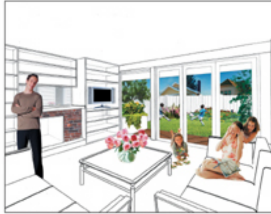
PRIVATE FAMILY SPACE