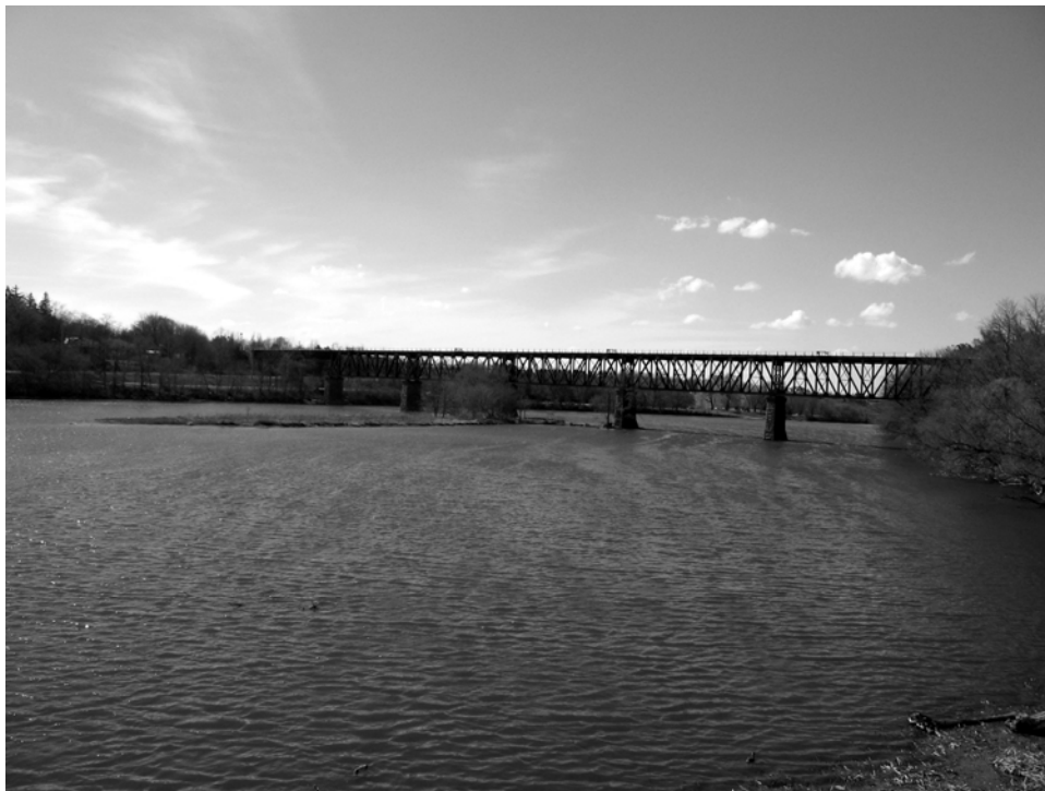
Cambridge, Grand River

“As a hub for every type of transportation, the city at the water’s edge is bombarded constantly by a range of stimuli of foods, goods, systems, people, and vessels, requirements, and technologies such as bulkheads, sea walls, drainage, electrical, transporting devices, and the like. The development of an adequate response of a unique society, one which far more readily accepts change and, in fact, demands a greater diversity. This response creates a cohesive but broad based culture.” (Torre, 3)