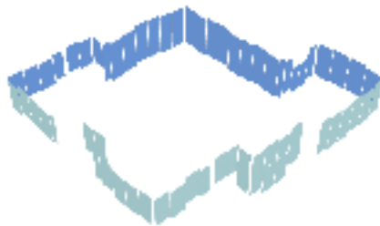
Image 2: Sound