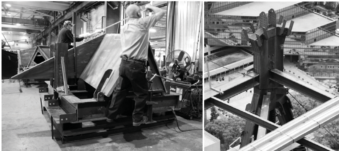
Figure 1. (Left) A node for the Bow Encana by Foster+Partners in Calgary, Canada. The side of the elements facing towards the atrium in the double façade was finished to AESS 4. The backside was concealed so finished as Standard Structural Steel. (Right) The north façade of the Bow Encana uses a modified diagrid in a concealed fashion. The node-to-diaGRID connections are welded. Temporary bolted connections are used to secure the members prior to welding.

As with any deviation from standard framing techniques, constructability is an important issue in diagrid structures. Both the engineering and fabrication of the joints are more complex than for an orthogonal structure, and this incurs additional costs. The precision of the geometry of the connection nodes is critical, so it is advantageous to maximize shop fabrication to reduce difficulties associated with erection and site work. Some nodes are many tonnes and it is desirable to be able to lift and turn the elements with a crane to provide access for fabrication, welding and finishing.