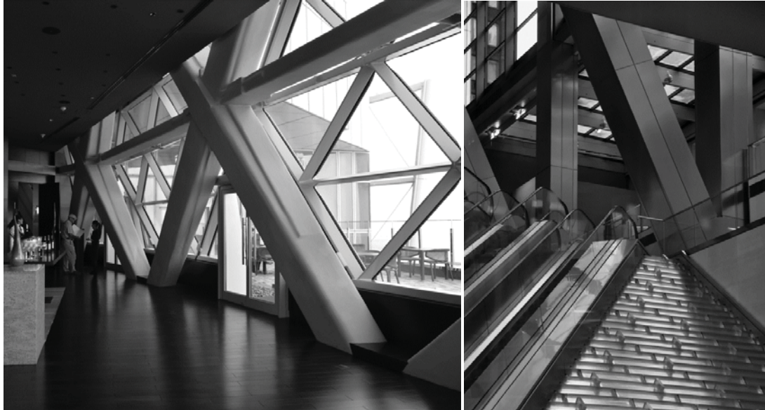
Figure 3. Capital Gate (Left) is able to expose its powerful diagrid, making the steel a vital part of the interior expression of the building. The Hearst Building (Right) must clad the members as is natural for a tall commercial building in New York City. This changes the feeling and apparancy of the steel in the space.

In some cases where the diagrid is chosen purely for its structural efficiency and is not expressed, either at all or largely hidden behind gypsum board, the detailing will be less of a concern for the Architect. However, if the diagrid will be clad as part of the architectural expression (see Shelley Street, Fig. 8), then the connections must be made as discreet as possible to minimize the bulkiness of the members.