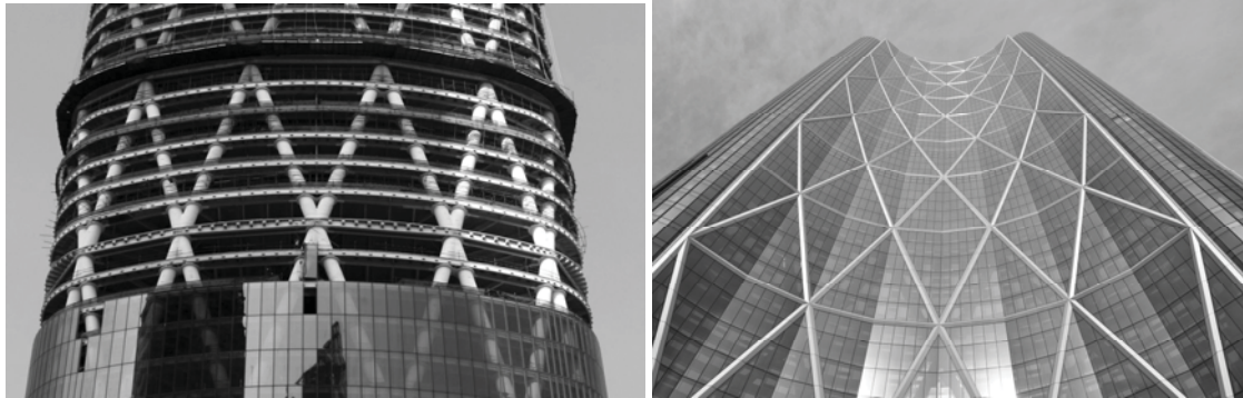
Figure 7. (Left) The Guangzhou International Finance Center in China uses a very transparent glass, combined with a rectilinear curtain wall that does not acknowledge the diagrid behind by means of including a dominant system of column covers. The massive tubular round diagonals are clearly seen through the glass and are lit at night to enhance their expression. (Right) The Bow Encana uses enlarged covers on the exterior to highlight the locations of the diagrids. The infill glazing is rectilinear.

The frequency and nature of operable units is also important when selecting or designing the curtain wall system. Natural ventilation is seeing an increase, even in some high rise types. If operators are desired the size of the unit, nature of opening, and protection from fall hazard must be considered. Combined uses, such as office and hotel, might also infer differentiated glazing, both in terms of transparency as well as inclusion of operable windows.