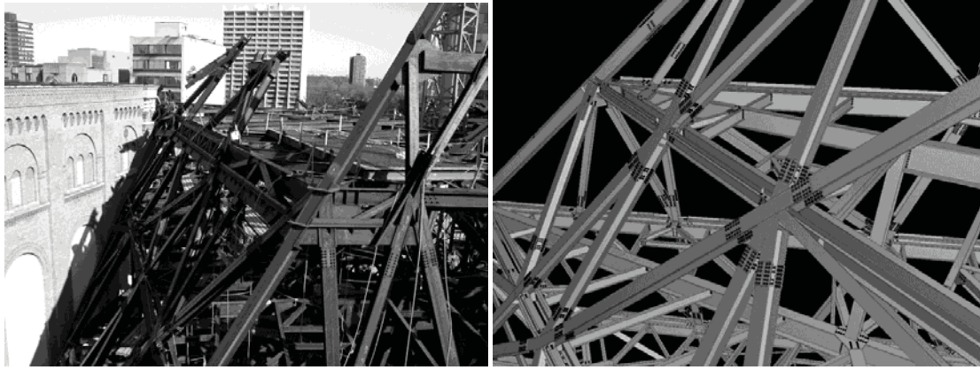
Figure 2. The irregular diagrid structure of the addition to the Royal Ontario Museum by Studio Libeskind used angles that were shallow. The design of the nodes and the sizing of the grid elements were adjusted to ensure that no temporary shoring was required. At Left the ROM during construction. At Right the fabricator's digital image of the structure showing the variety of connection types that had to be detailed.

In many of the diagrid projects constructed to date, the nodes have been prefabricated as rigid elements in the shop allowing for incoming straight members to be either bolted or welded on site more easily. This moves the connection points away from the centroid of the node and to points that may be more than a meter away. This allows for easier access to complete the connections on the construction site. From a practical perspective, if using bolting, more than one ironworker can assist in completing the work at the node.