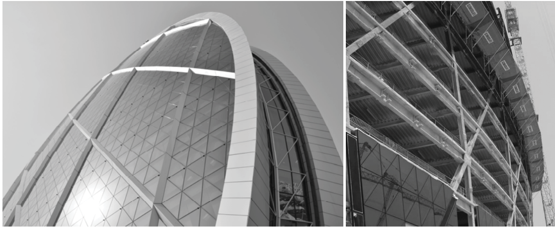
Figure 5. Aldar HQ in Abu Dhabi is the only circular diagrid tower. The diagrid has been constructed from standard structural steel (wide flange or universal column sections) and a spray fire protection used.

Capital Gate in Abu Dhabi also uses triangulated glazing but makes a more unobtrusive gesture on the façade regarding the location of the diagrid situated behind the glass. The very small 2 storey module size for Capital Gate, to support the 18° lean, has resulted in one of the smallest modules to date. The member sizes are large and to translate this to the façade would have been quite overbearing. Instead a slight color change at the grid is used to acknowledge the pattern. These sorts of twisted forms tend to subdue the reading of the module through to the façade.