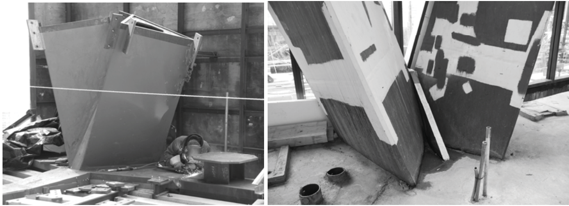
Figure 4. The AESS diagrid of the Bow Encana uses welded joints between the node and the diagonal. As these surfaces are exposed within the atrium, they have been filled and ground after welding so that the transition is invisible once painted. The Left image shows the temporary bolted tabs used to secure the diagonal prior to welding. At Right the connection being filled and sanded to achieve a seamless appearance.