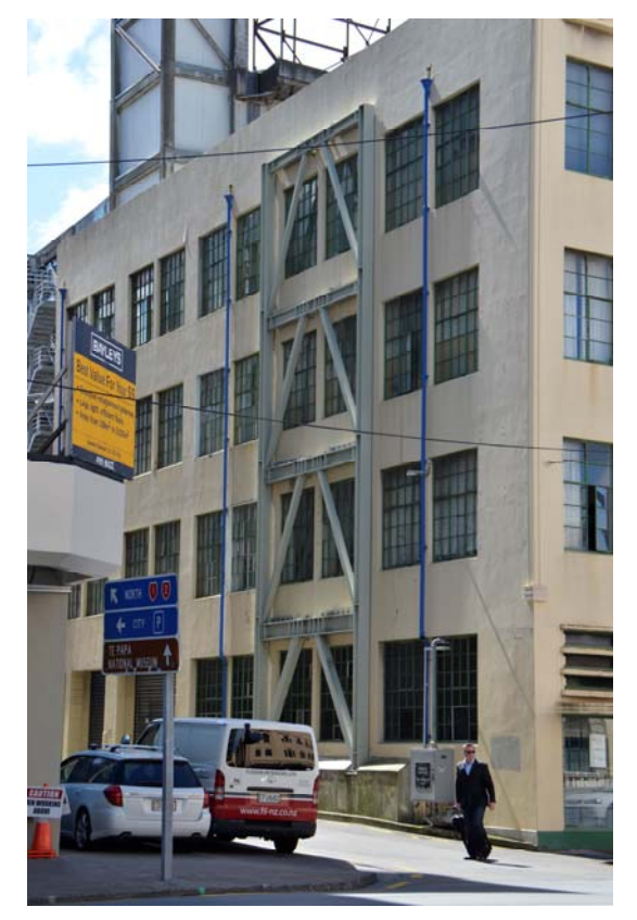
Figure 8: Existing seismic retrofit in Wellington, New Zealand.

Retrofitting existing buildings to bring them to seismic code compliance is a challenge to designers. The bracing systems often end up being exposed as a degree of the difficulty of the nature of making them fit with the existing structure. If an aesthetic of exposed seismic bracing is adopted into use in general, then it will be easier for retrofitted buildings to begin to work within this framework. This would be the case in particular for situations where the bracing is placed on the exterior of the building. This form of retrofit is less disruptive to the function of the business or use, but tends to result in a disruptive aesthetic result. If exterior braces were developed "architecturally" there could be more coherence in the design, and where such retrofits are widespread, consistency in approach in neighbourhoods.