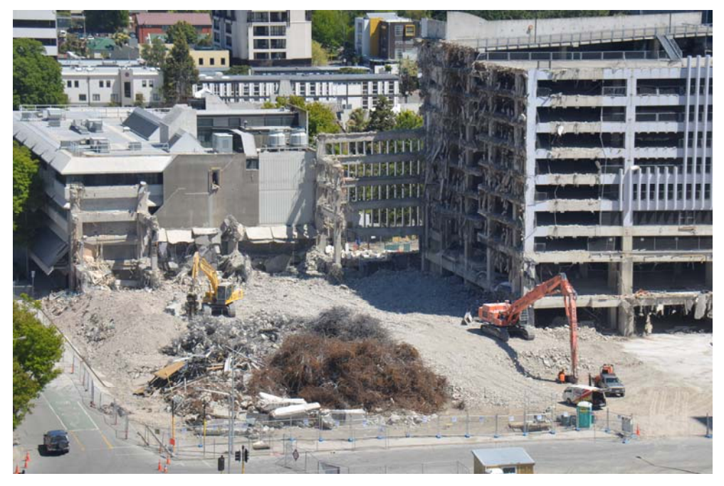
Figure 1: View of Christchurch Central Business District, November 2012. The demolished reinforced concrete has its rebar separated for recycling.

The large scale demolition of the damaged concrete buildings produces material for recycling, but nothing more. To witness buildings that on the surface might appear to be intact, being demolished, is extremely depressing.