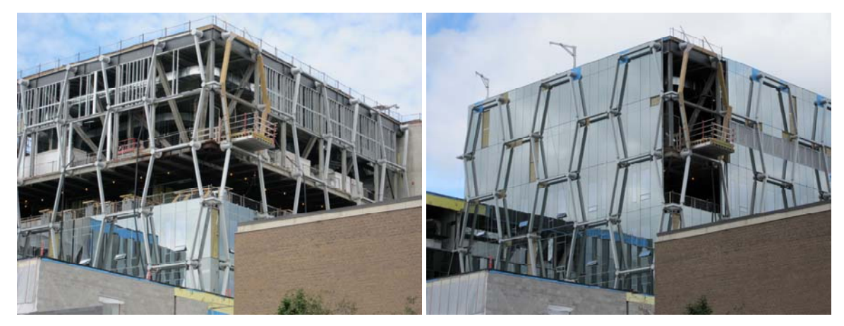
Figure 11: A system of exterior bracing is used on this laboratory building at the University of Waterloo in Canada, designed by KPMB Architects.

AESS bracing systems and diagrids indicate that there is potential for shifting the traditional concealment of seismic bracing systems to an exposed condition. This provides an architectural opportunity in terms of the aesthetic expression of the steel systems as well as a way to provide for quick inspection and repair in the post quake scenario. Exposure of the systems eliminates much of the required removal of finishes in order to carry out the inspections, saving time and money.