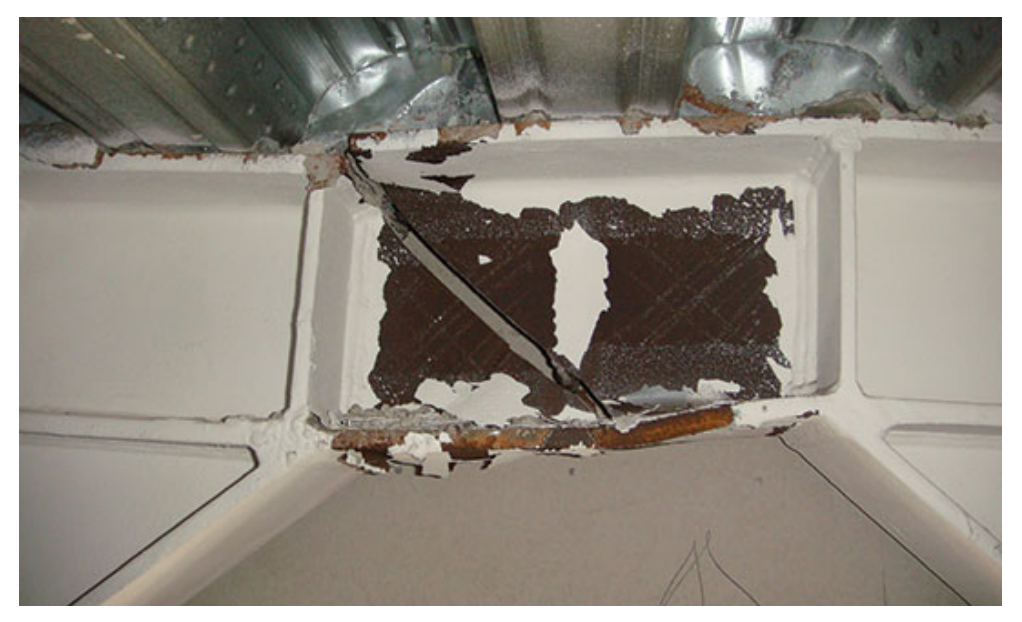
Figure 2: Fracture in an Eccentrically Braced Frame in the Pacific Tower.

"Completed in 2010 and comprising eccentrically braced steel frames cast integrally with composite metal deck slabs, the building also incorporates several innovative features. These include carstackers, cranked braces and 'super' moment-resisting frames at ground floor level. The latter remove the need for braces from the front elevations of the building, allowing unobstructed views."[4]