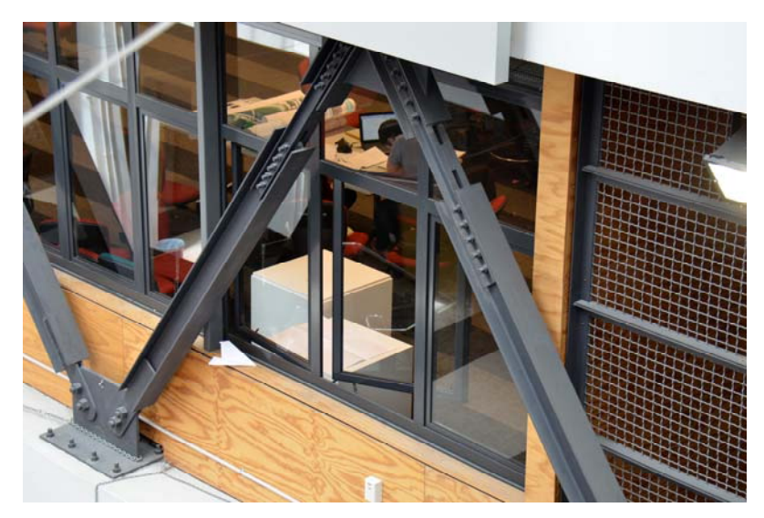
Figure 9: This retrofit bracing is located in the atrium of the School of Architecture in Wellington, New Zealand. These innovative braces are using fairly standard, tested, section types but creating a different sort of bolted link section. They have become a key aspect of the architectural aesthetic of the space.