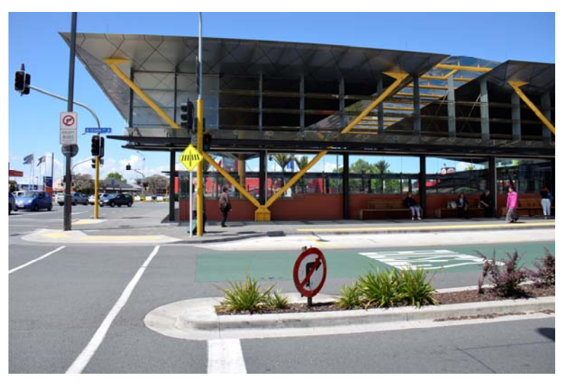
Figure 5: The New Lynn Transit Station in Auckland, New Zealand uses AESS effectively to create Award Winning architecture. The diagonal braces could easily provide the basis for a "seismic aesthetic" if modified for that purpose.

Exposed bracing systems have already been successfully adopted by some Christchurch businesses. The Lesmills Fitness Centre makes a simple expression of the braced steel frame behind its façade. It is architecturally exposed to the interior as well as exterior through the glazed façade. To speculate on more widespread use of this type of framing, with the added benefit of the replaceable link system seems to make a lot of sense.