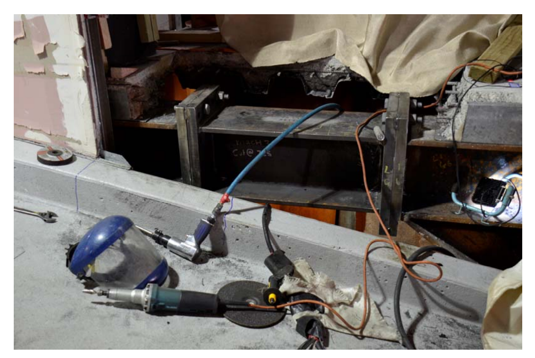
Figure 3: A link element in a braced frame in Pacific Tower. Note that the wall had to be torn away to provide access to the joint, and the access is still not ideal for labour.

The steel bracing system in the Pacific Tower is concealed and is therefore taking longer to remediate. Damage must be done to the building to expose the braces for inspection purposes. This adds to the cost and time for repair. However since the inspection requires the exposure of all of the vulnerable points of the frame, the system is being retrofitted with new links as part of this process. As the bracing system was not designed with exposure in mind, many of the sections that are in need of remediation and repair are located in very difficult to access locations. This also slows the repair process.