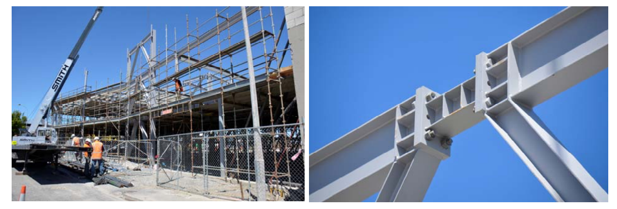
Figure 7: A braced frame in the Three35 Project that uses a "replaceable link" in post earthquake construction in Christchurch.

All of this would point to a system that promotes architecture that is more responsive to a quake scenario by being more adaptive if damaged.