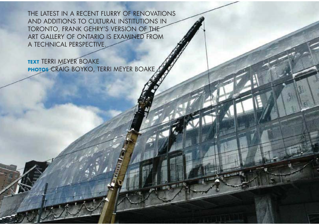
LEFT, TOP TO BOTTOM A CRANE HOISTS ELEMENTS INTO PLACE ON THE NEW NORTH FAÇADE OF THE AGO; A COMPLEX NETWORK OF SCAFFOLDING IS REQUIRED TO SCULPT THE INTERIOR SPACES OF THE AGO, AND THE SIGNATURE CURVE OF THE STAIRCASE IS ALREADY BEGINNING TO DEFINE THE SPACE AT THIS RUDIMENTARY STAGE. OPPOSITE A PHOTOGRAPH OF ONE OF THE FIVE ORGANICALLY CURVING STAIRS CAPTURES IT AS A POETIC WORK IN PROGRESS.

imposed severe constraints on the possible scope of the design of the addition, and on restricting the staging area for all aspects of the construction. One lane of both Dundas and Beverley Streets remain appropriated even into May 2008.